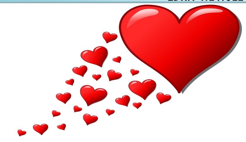
From the Loomis Basin Horsemen's Association