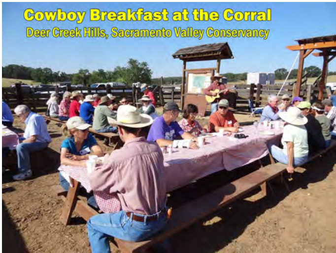
Cowboy Breakfast at the Corral Deer Creek Hills, Sacramento Valley Conservancy