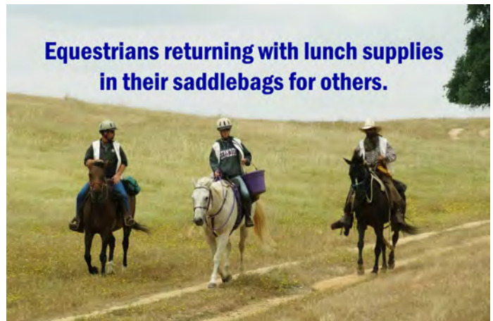
Equestrians returning with lunch supplies in their saddlebags for others.