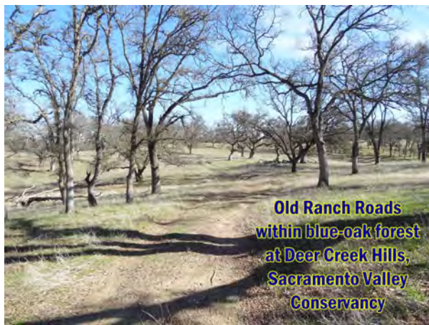
Old Ranch Roads within blue-oak forest at Deer Creek Hills, Sacramento Valley Conservancy