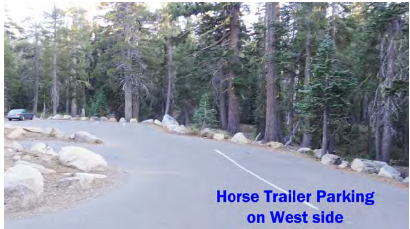
Horse Trailer Parking on West side

Turn off Highway 88 at the Woods Lake signpost. Follow a narrow paved road and turn off at the trailhead signpost shown above.