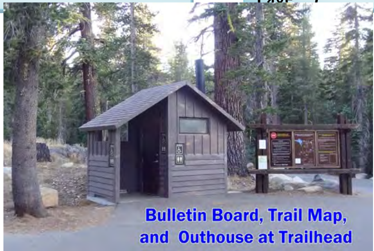
Bulletin Board, Trail Map, and Outhouse at Trailhead