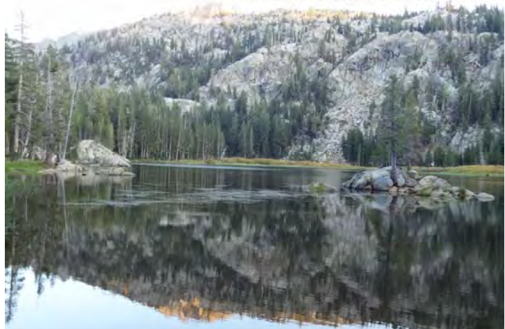
Woods Lake at Sunset

Trails lead steeply upward to Round Top Lake and Winnemucca Lake. These trails connect to the Pacific Crest Trail that crosses Highway 88 near Carson Pass.